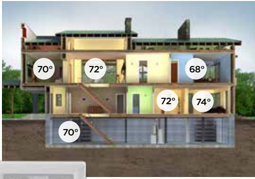
Individual thermostats or zone sensors provide flexibility in temperature management. Control temperatures from the master stat or from separate zone stats.